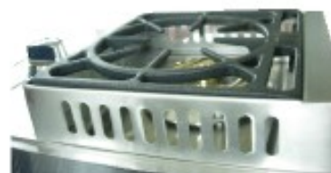
Flat for Pan cooking