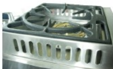
Convex for Pot cooking