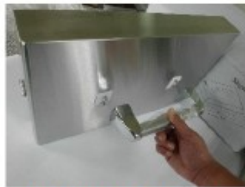
2.Point the handle to gaskets and fix it with bolts on the lid