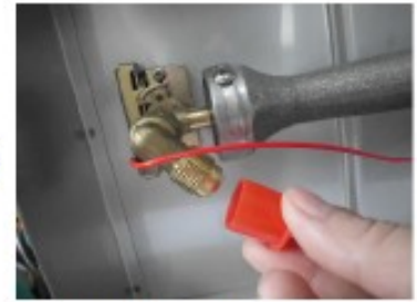
3.Remove red sleeve