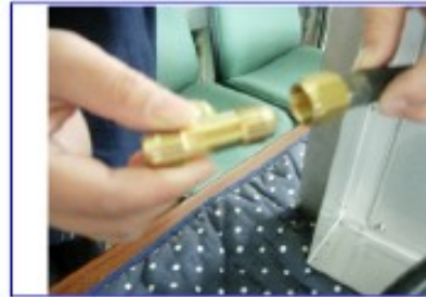
5.LP Gas usage: Connect the T-fitting with Gas Hose