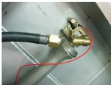
4.Connect Gas Hose with switch