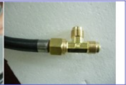
Attach one end of T-fitting to Regulator, the other end to Grill