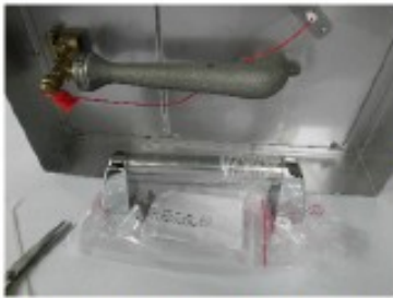
1.Remove the handle set under side burner